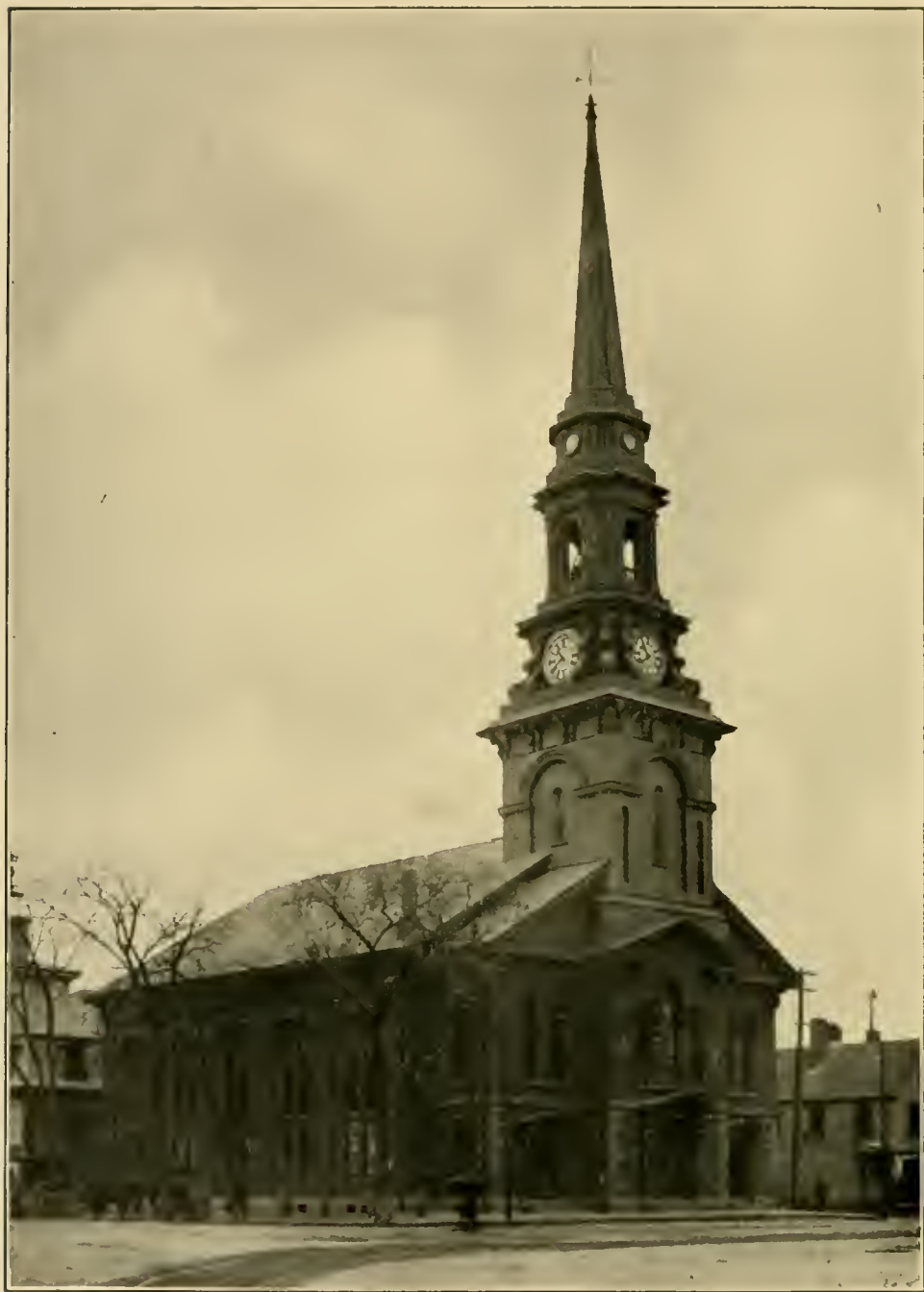
NORTH CHURCH, PORTSMOUTH, N. H., ERECTED 1855.